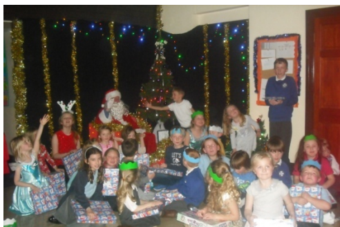
Christmas disco 2015

Since the children have been back after the Christmas break, they very busy in preparation for Chinese New Year, Valentines Day and creating their new Birthday wall display!